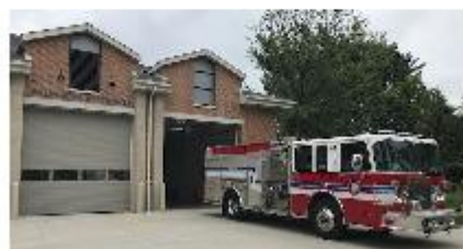
Engines 30 (Rapid Run) & Engine 36 (Greenwell)